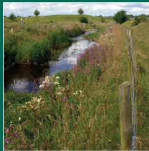
Habitat restoration on the River Grange, Ireland. Left: Immediately after completion of the work. Right: The same section of river seven years later.