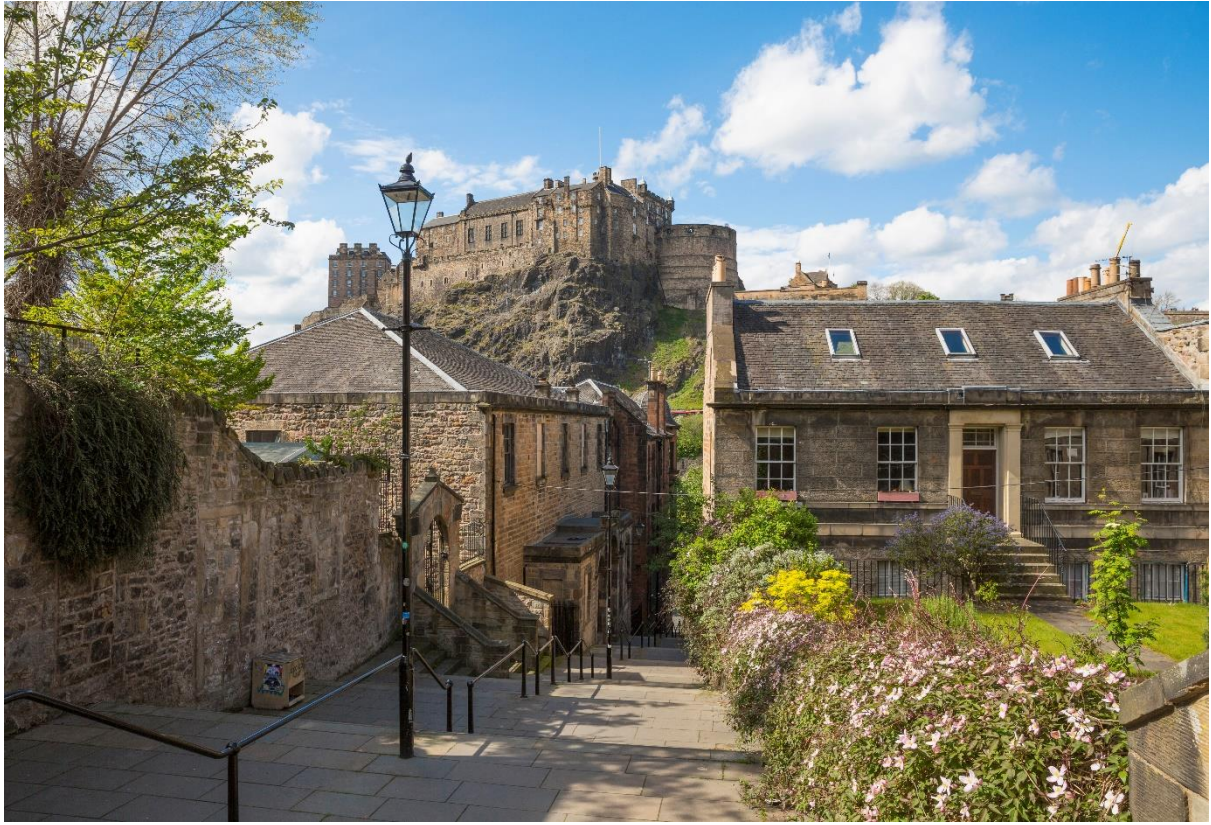
Edinburgh Castle viewed from the Vennel by the Grassmarket.