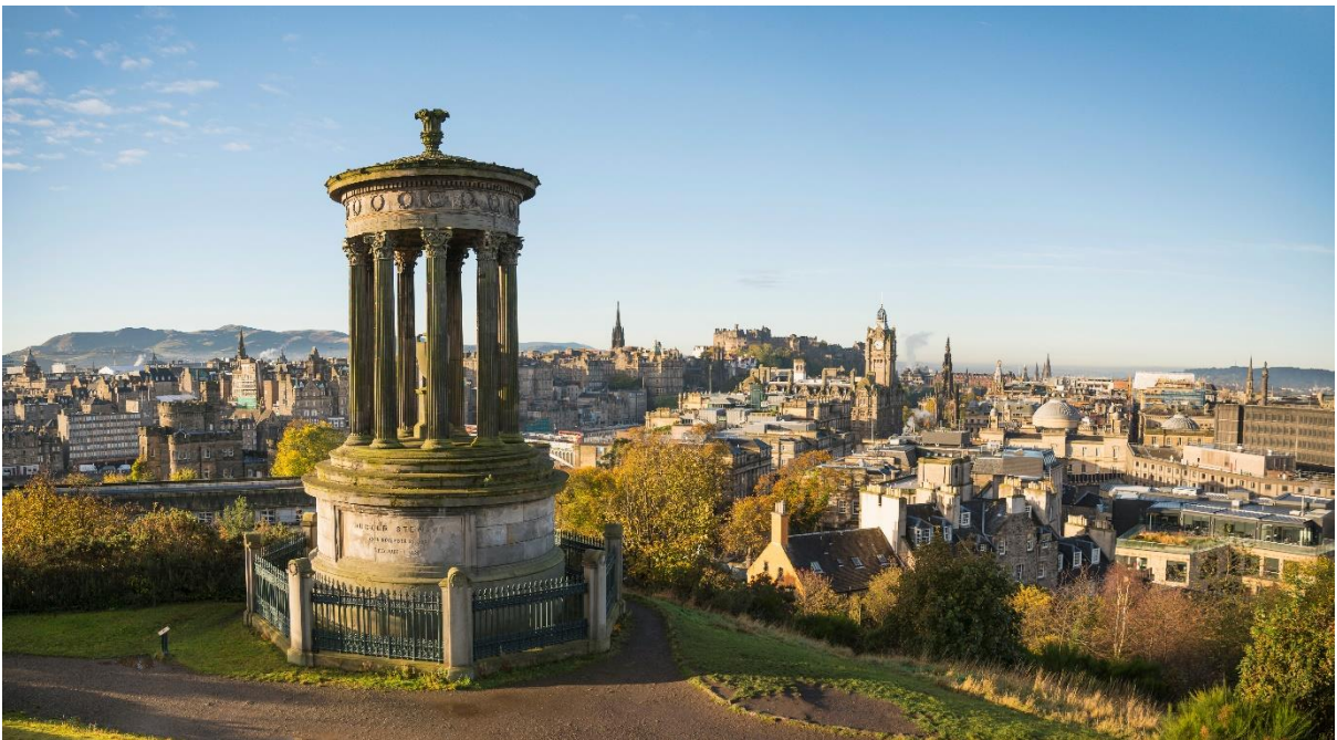
Cover photo: The Dalmahoy Hotel and Country Club, Edinburgh Inside-cover photo: The Dugald Stewart Monument on Calton Hill, Edinburgh.