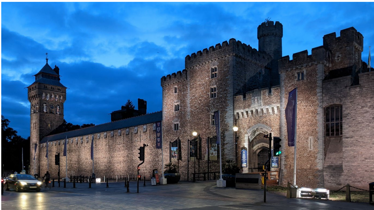
Cover photo: Cardiff Bay HDR Contents page photo: Exterior of Cardiff Castle