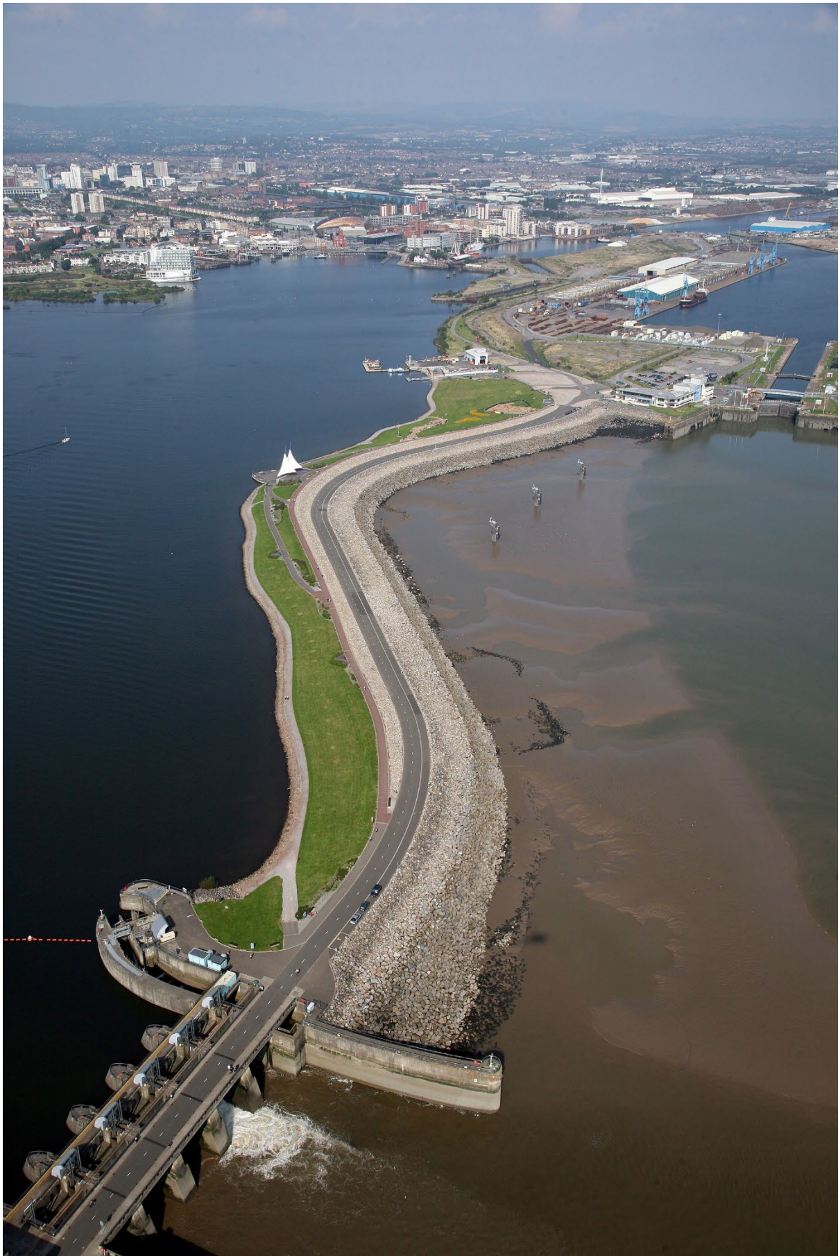
Aerial View of Cardiff Bay Barrage.